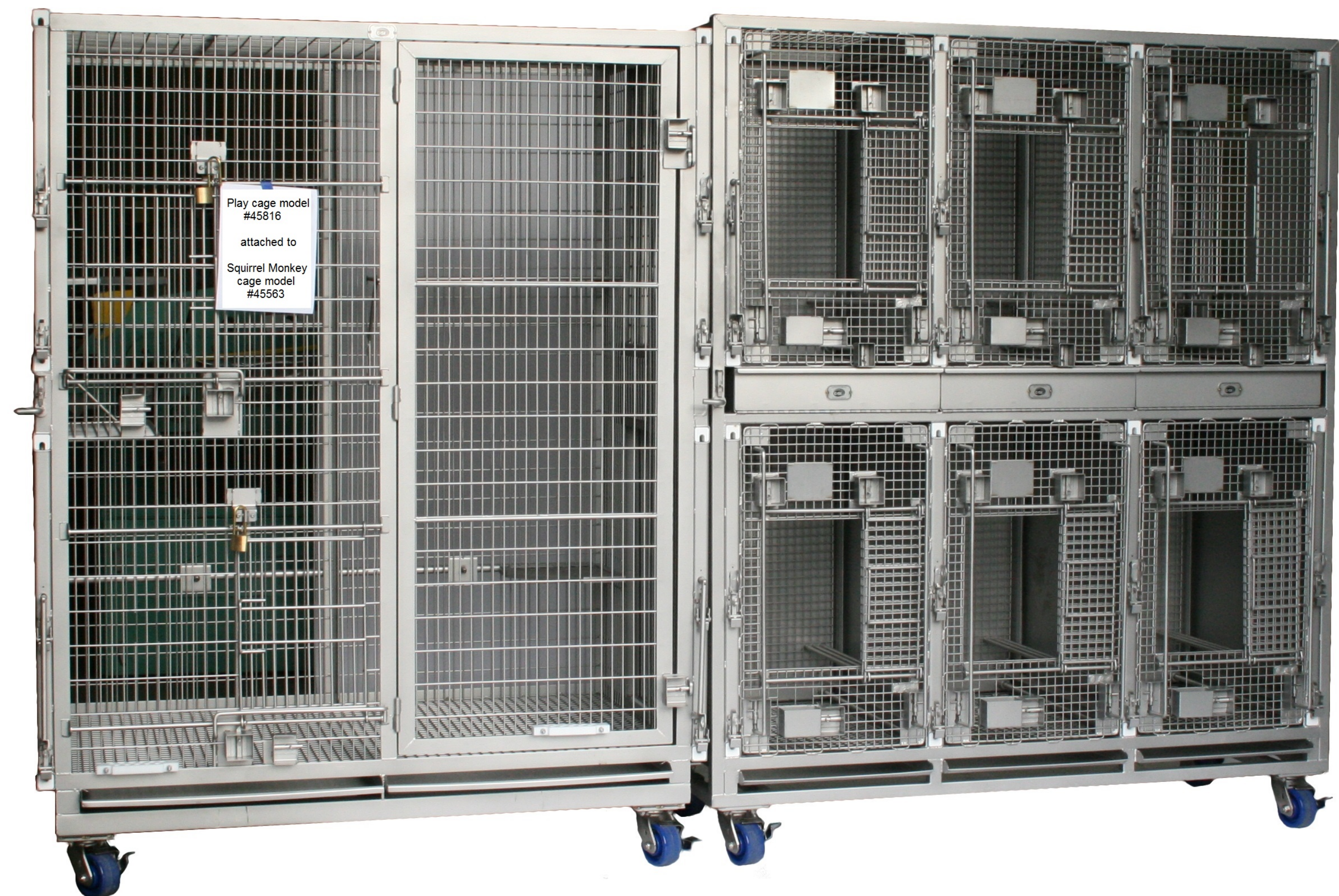
Model #45816 play cage attached to Model #45563 Socialization Rack

These racks and cages were custom designed for prominent individuals at Oregon Health & Science University. Our customers never need to settle. We take great pride in designing and manufacturing products that perfectly match our customer's needs.